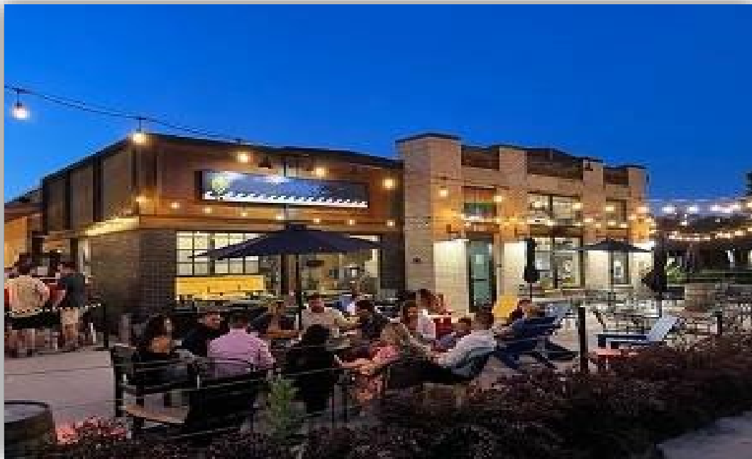
ARTIST RENDERING OUTDOOR SEATING