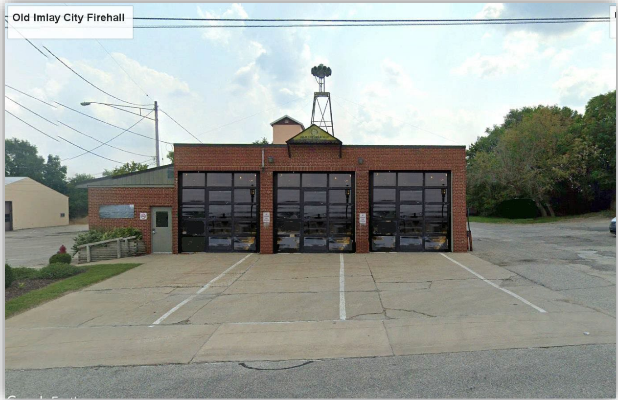
ARTIST RENDERING OF EXTERIOR OF FIRE HALL WITH ROLL UP GLASS DOORS